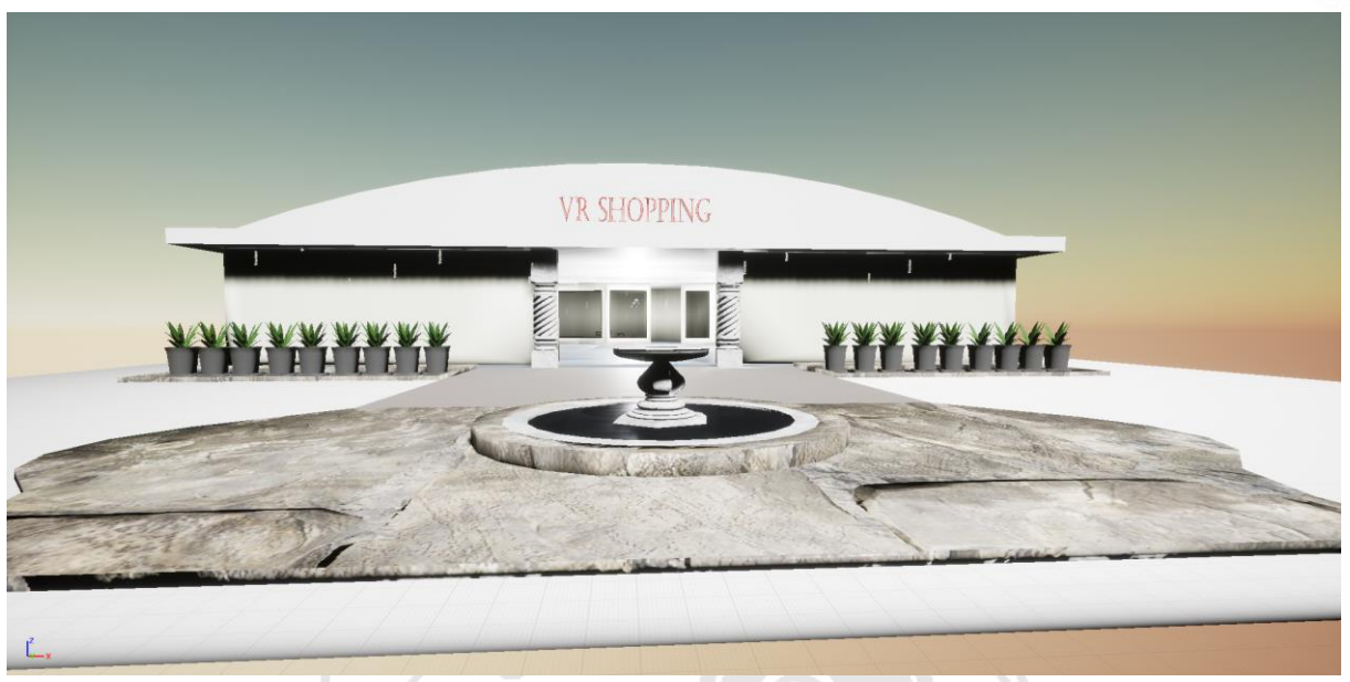
Figure 1: The VR E-commerce shopping mall