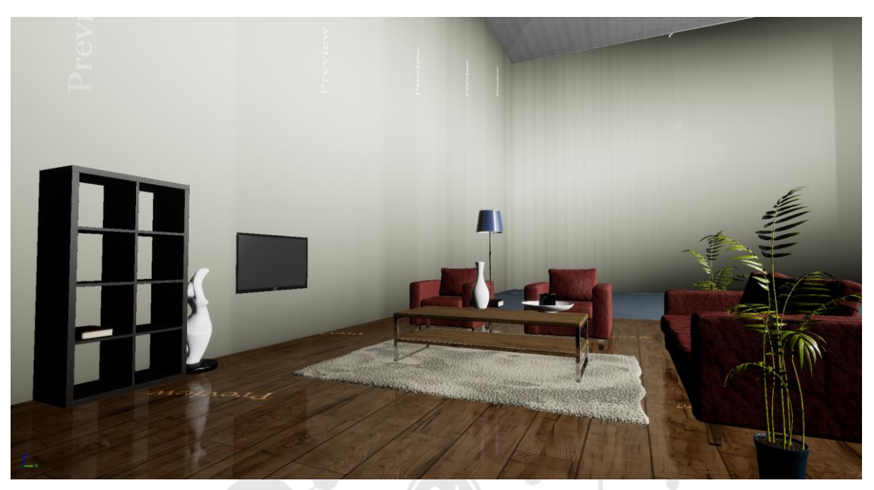
Figure 3: An example of a rented store in the mall

For demonstration purposes, a store was developed and set up inside one of the implemented Shopping rooms. As described previously in the section 3, a furniture store was chosen because it has a wide variety of products with different sizes and peculiarities. The figure 2 Demonstrates in more detail the stores of the mall and the figure 3 refers to the cited furniture store.